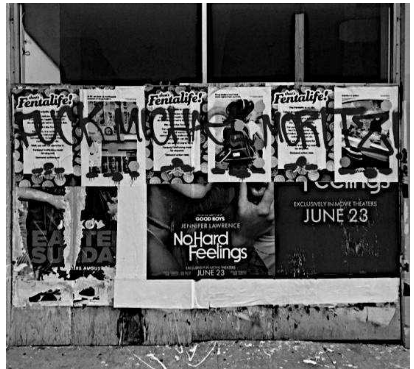
Graffiti reads, "Fuck Michael Moritz!"

A "street art" campaign backed by Welsh tech billionaire and venture capitalist Michael Moritz is being targeted by graffiti artists in San Francisco, California. The campaign features posters and even wheat-pastes which call for a "law and order" approach to homelessness and fentanyl related deaths in San Francisco.